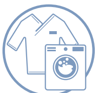
Uniforms & Linens