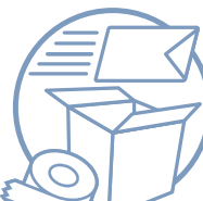
Packaging & Shipping Supplies