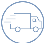
Small Package Shipping