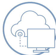
Software as a Service